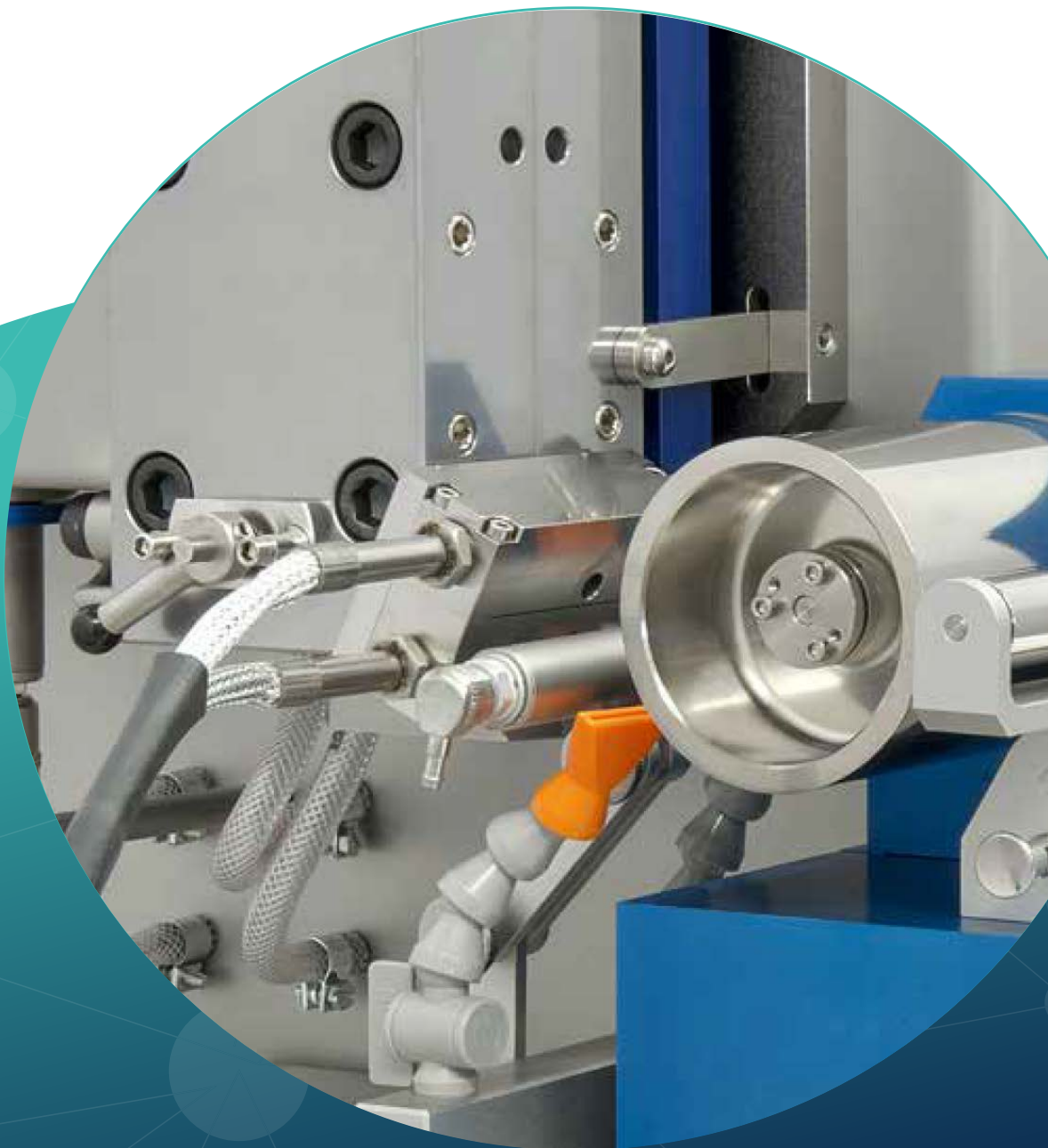
Table top micro cast film line for R&D applications