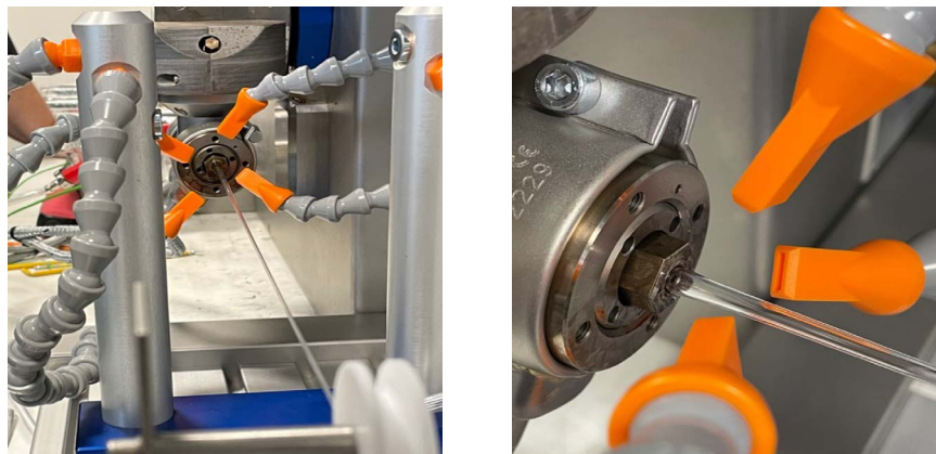
Figure 1. The micro-tube die attached to an MC 15 HT

In this article, we aimed to show how the micro-extrusion parameters affect the size/shape of the micro-tube prepared using a biomedical-grade thermoplastic polyurethane. A picture of the micro-tube die is given in Figure 1.